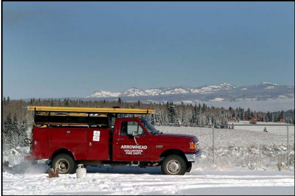
Beautiful Day.