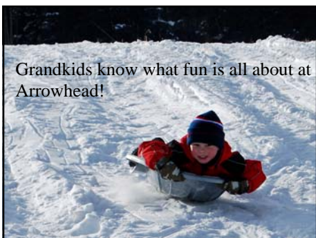
Grandkids know what fun is all about at Arrowhead!