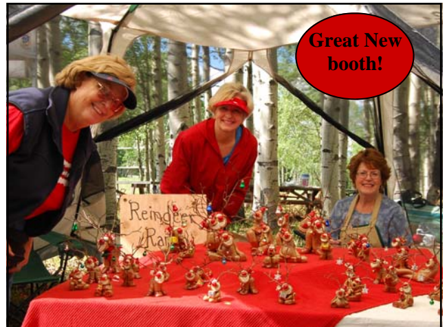
Great New booth!