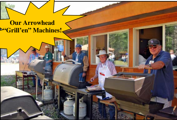
Our Arrowhead "Grill'en" Machines!