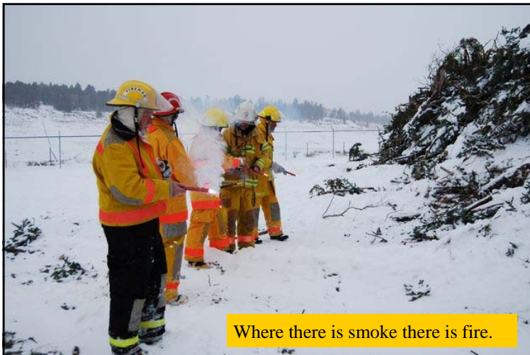
Where there is smoke there is fire.